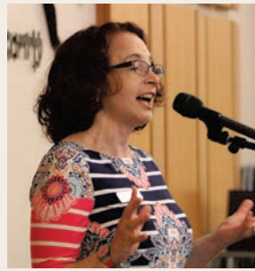
Introducing the Blockstein lecturer in 2017.

JSS became a part of my life nearly 17 years ago, so I am not going to entirely disappear. I know that